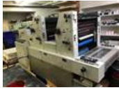
Reference number: 21012 ADAST DOMINANT 526 A Sheet-fed Offset Printing Machine