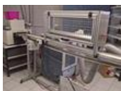
Reference number: 20044 PLEXTOR ARX 2 - 010 plastic card printing machine