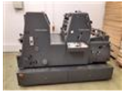
Reference number: 22025 HEIDELBERG GTO Z NN - 52 + NUMBERING Sheet-fed Offset Printing Machine

Year of Production: 1992 ; Number of Colours: 2 ; Counter: - ; Max. Size: 360x520 mm (14.2"x20.5") approx. B3 ; Availability: immediately ; conventional dampening, no perfecting, low pile delivery, manual plate loading, powder sprayer, second printing unit adapted for numbering