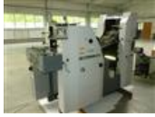
Reference number: 22046 HAMADA DUETTO III Sheet-fed Offset Printing Machine