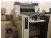
Reference number: 17049 ADAST DOMINANT 816 Sheet-fed Offset Printing Machine

Year of Production: about&nbsp;1992 ; Number of Colours: 1 ; Counter: 28 mil. imps. ; Max. Size: 520x740 mm (20.5"x29.1") approx. B2 ; Availability: immediately ; conventional dampening, no perfecting, high pile delivery, manual plate loading, powder sprayer