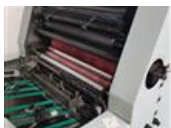
Reference number: 19045 ADAST DOMINANT 515 + UV AEROTERM OL 620 Sheet-fed Offset Printing Machine