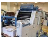
Reference number: 22076 KBA PERFORMA 66 - 2 Sheet-fed Offset Printing Machine