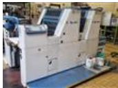
Reference number: 22075 KBA PERFORMA 66 - 2 Sheet-fed Offset Printing Machine